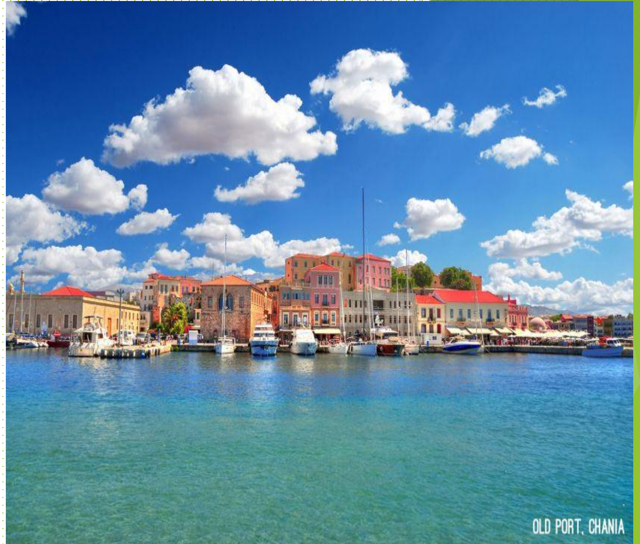
OLD PORT, CHANIA